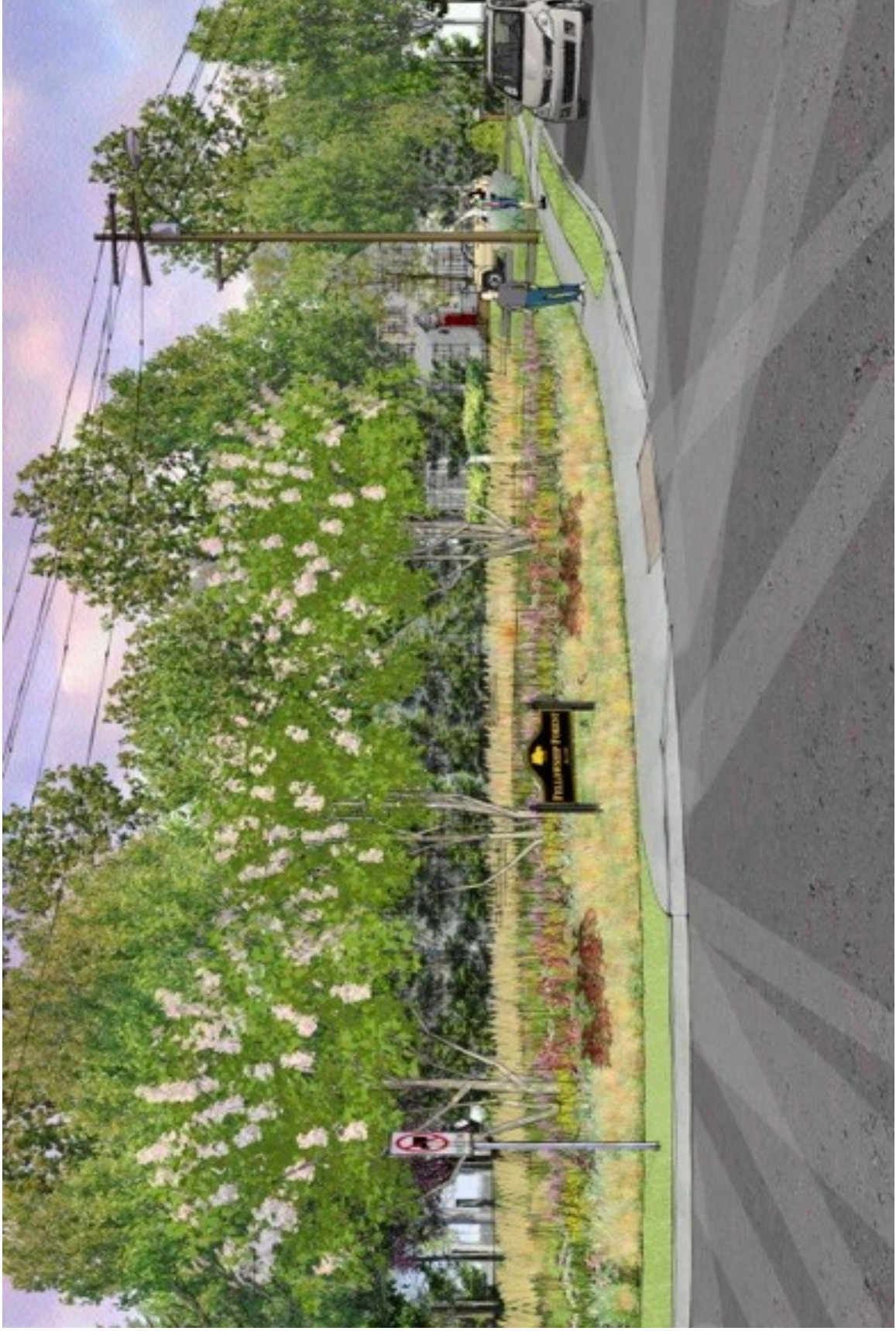
Illustration prepared by: Wisa Kompayak (Hoehn Landscape Architecture/ Emfesis, LLC)